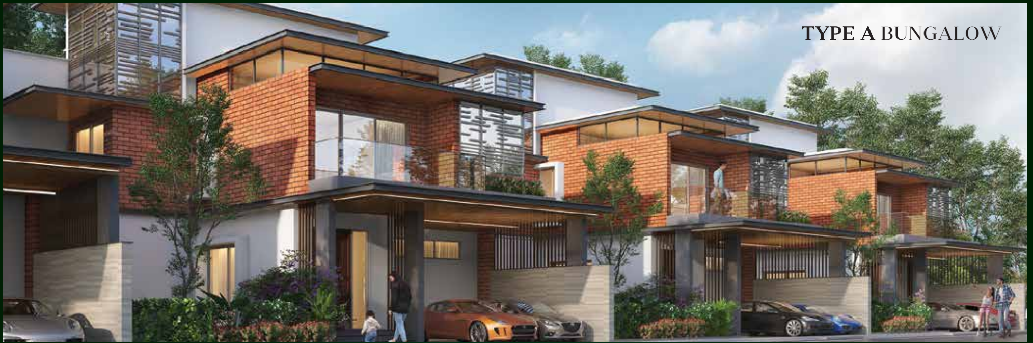
TYPE A BUNGALOW