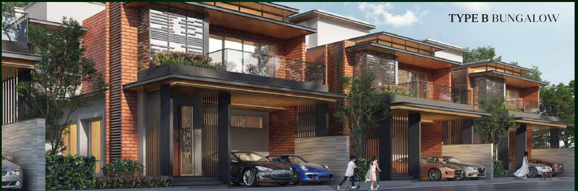
TYPE B BUNGALOW