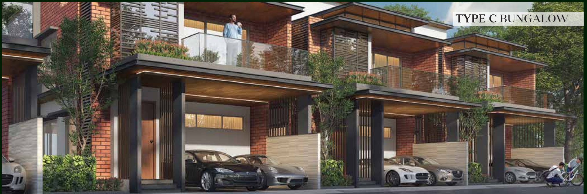
TYPE C BUNGALOW