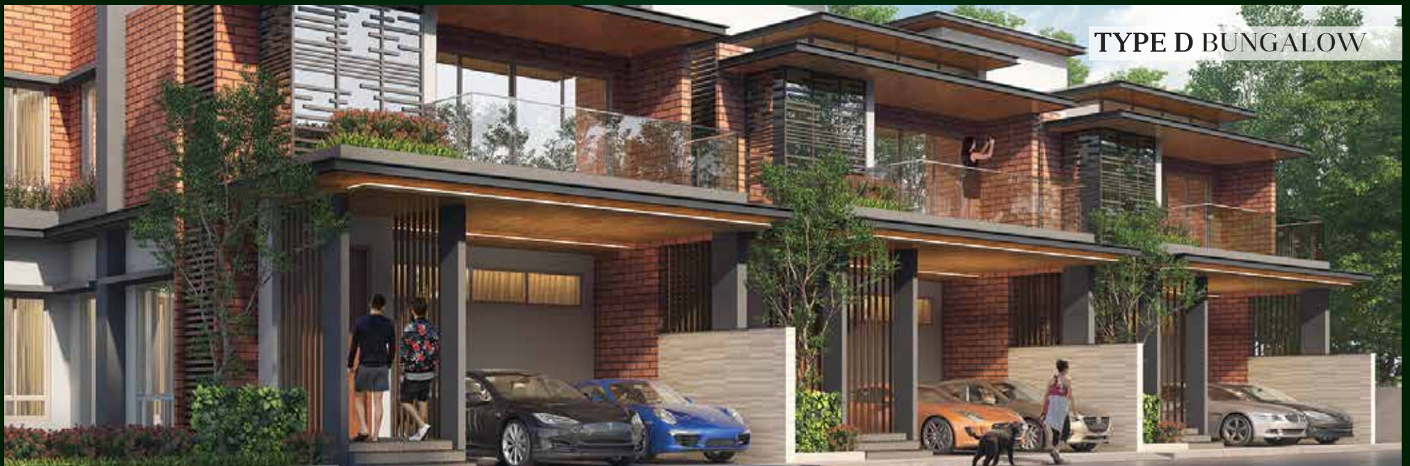
TYPE D BUNGALOW